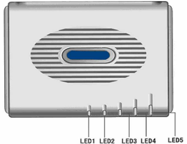
Front view of the Device