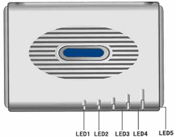
Front view of the Device