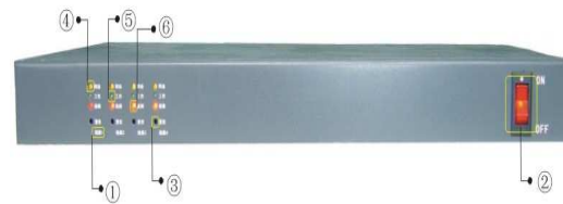
Front view of the Device