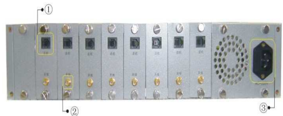
Back View of the Device